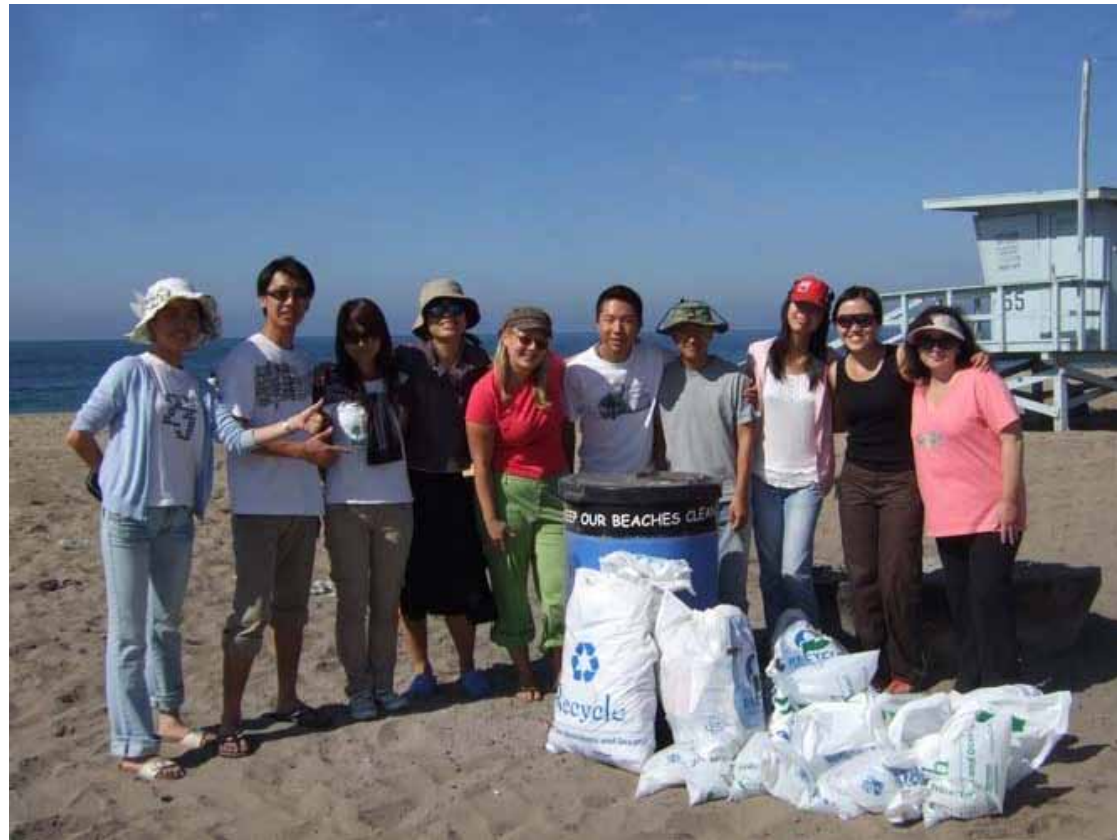
2008 W. T. Chan Fellowship Retreat

Foundation support was used to run two conferences, one in Guangzhou in January 2009 and one in Albany, New York in May 2010. The conferences' goals were to foster research collaborations between doctoral students and faculty at Sun Yat-sen University and scholars from the Urban China Research Network as well as to provide all scholars the opportunities to utilize cutting-edge urban theories and methodologies in field research conducted in China and the U.S.